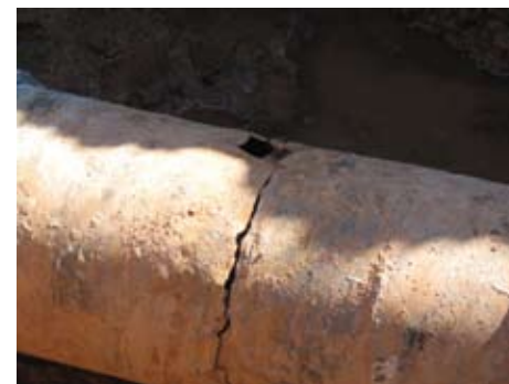
Raw Water Line...caption

These are just some of the major projects, which will occur within the next two years. Our goal is to improve the City for the future ahead in order to elevate the quality of life. We thank you for your support and help. The City of Henrietta is committed to serving our citizens and protecting the various infrastructure and investments that make up this community.