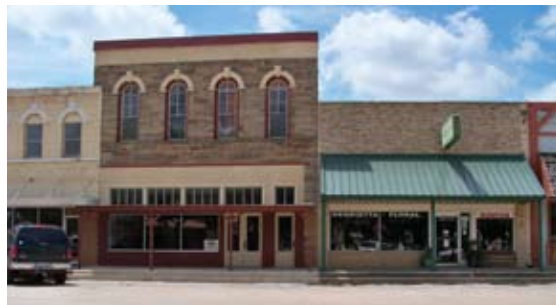
AFTER: Gilbert Street properties all spruced-up.