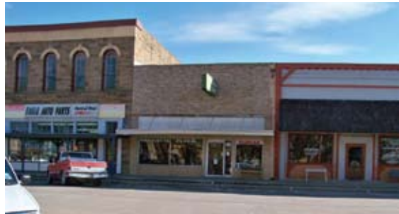
BEFORE: Gilbert Street properties before the face-lift.