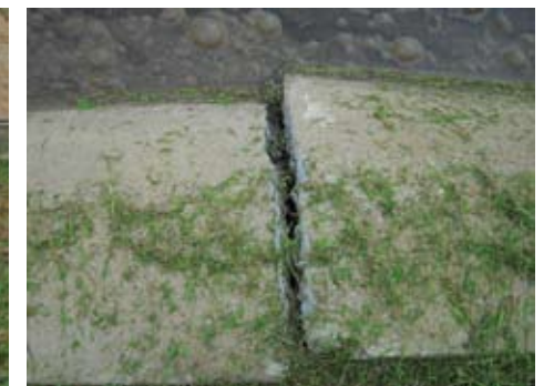
Race Track Damage...caption